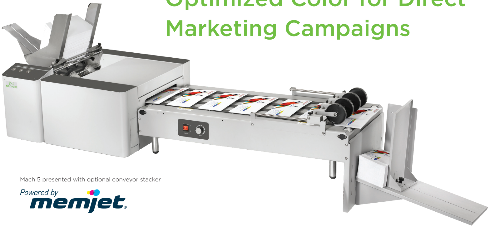
Mach 5 presented with optional conveyor stacker