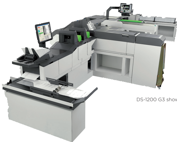
DS-1200 G3 shown